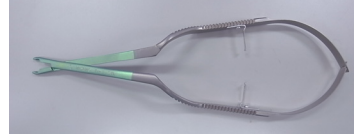
Appliers for Standard type: Green