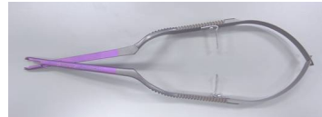
Appliers for Mini type: Pink