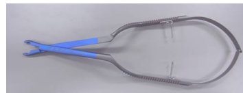
Appliers for Long type: Blue